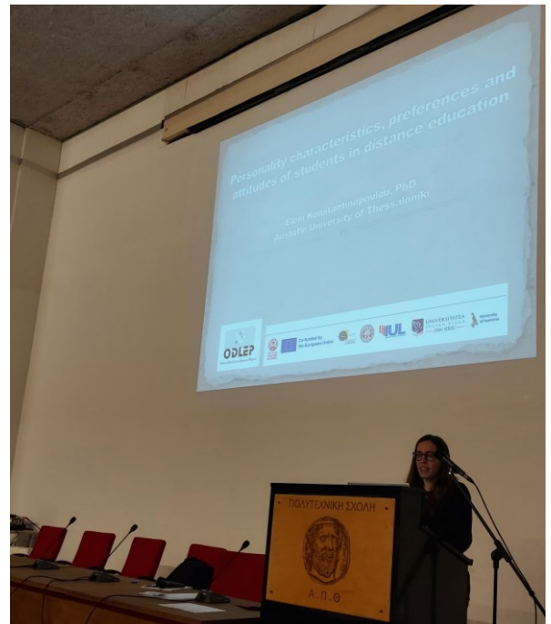
Personality characteristics, preferences and attitudes of students in distance education, E. Konstantinopoulou, PhD